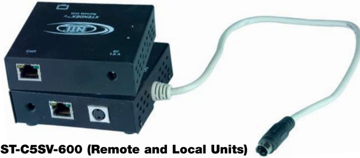
XTENDEX® ST-C5SV-600 (Remote and Local Units)