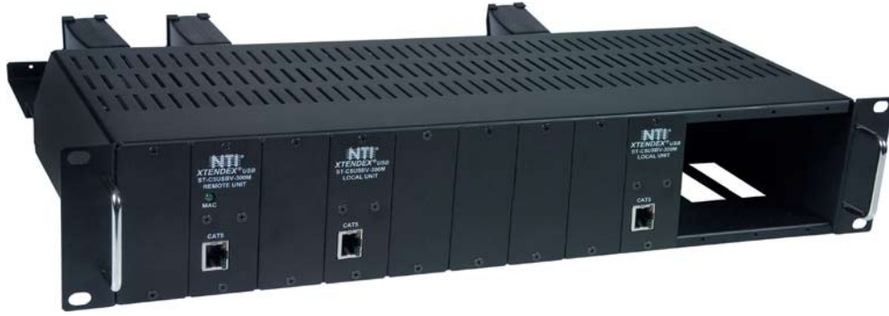
XTENDEX® ST-C5RCK-12 with ST-C5USBVA-300M Extender Modules (Front & Back)

Mount up to 12 USB KVM extender modules into a single 2RU rack tray