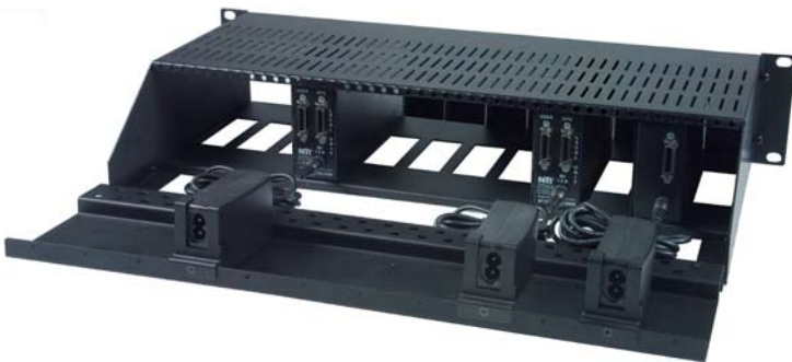
2RU Rackmount Extender Module Tray w/Cable/Power Supply Management Shelf (Standard Feature)