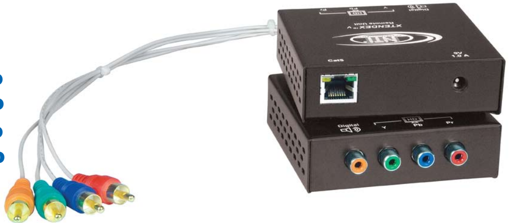
XTENDEX® ST-C5HDA-600 (Remote and Local Unit)