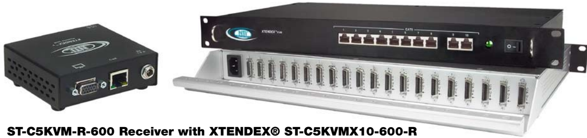
ST-C5KVM-R-600 Receiver with XTENDEX® ST-C5KVMX10-600-R

Extend control away from up to 10 PCs and/or NTI KVM switches