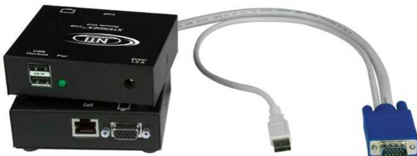
XTENDEX® ST-C5USBV-300 (Remote and Local Units)

Extend USB keyboard, USB mouse and VGA monitor up to 91 meters