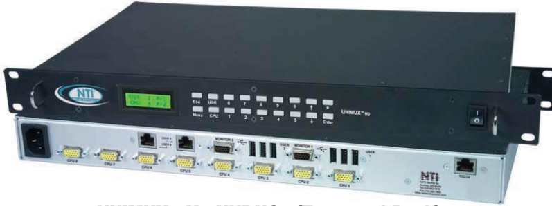
UNIMUX-4X8-UHDUC5 (Front and Back)

Up to four users can control 32 USB computers